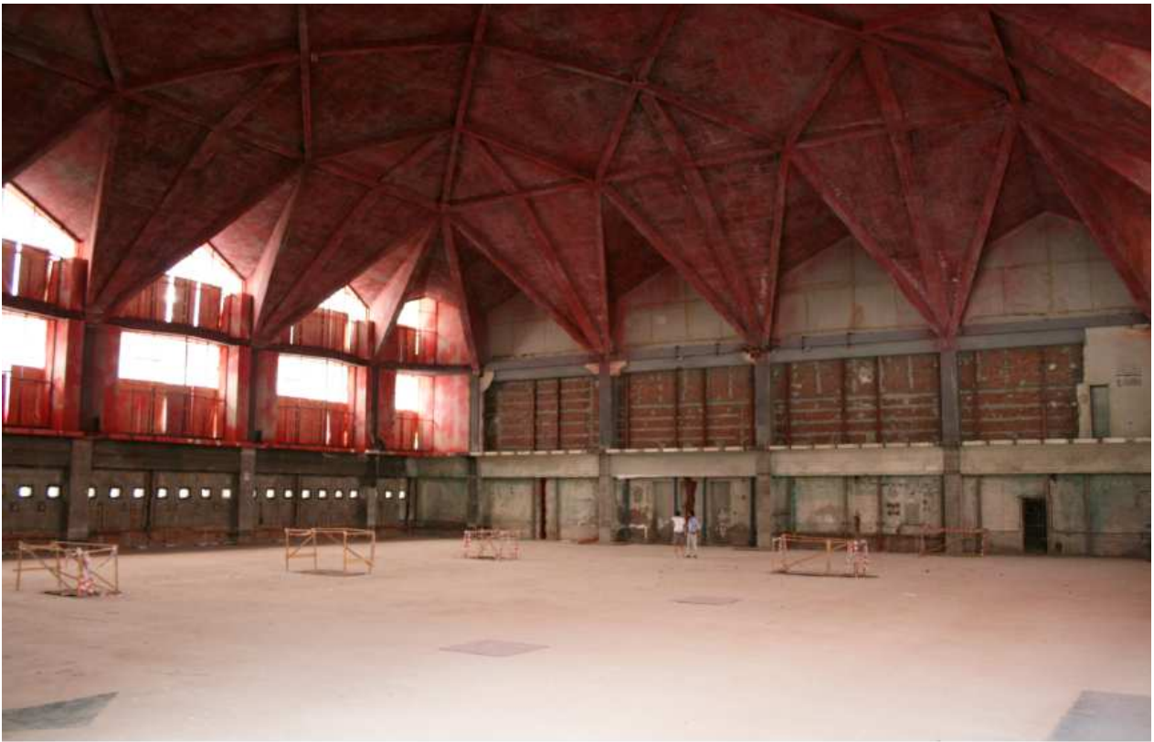
The Stock exchange in Turin, 1953 -56. Actual situation, 2018