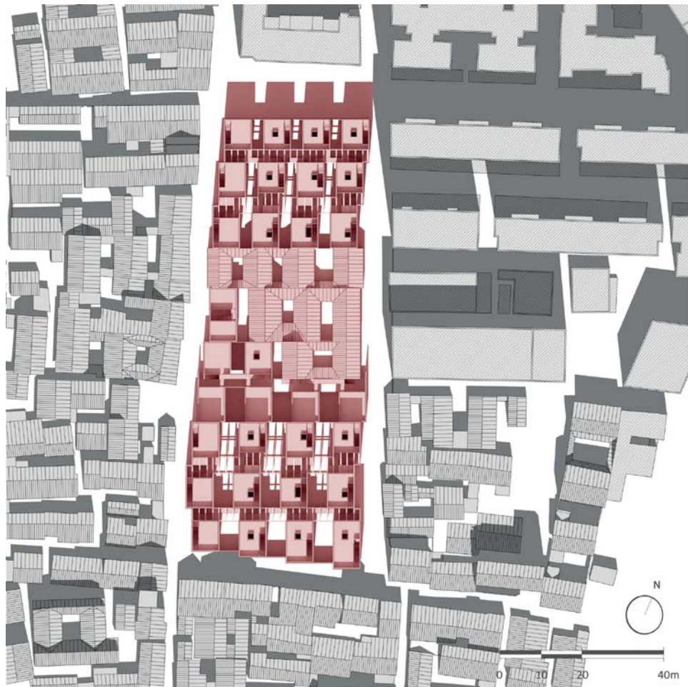
The new courtyard house typology