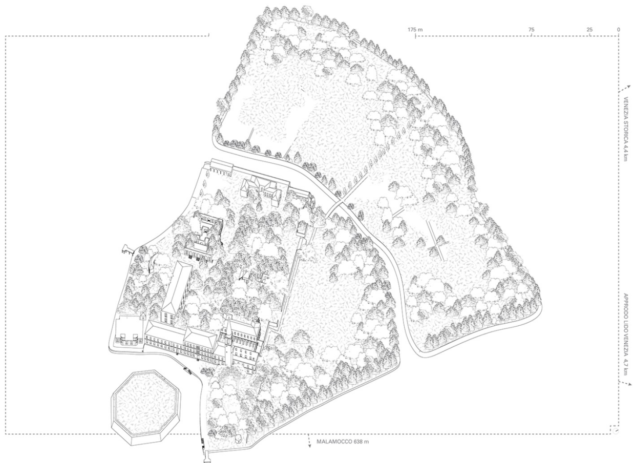
Graphic output of the physical survey of Poveglia

Moreover, the research was completed by creating a dialogue with the association and the people that are trying to redefine an identity for the island and fighting for its reinclusion into the Venetian economy.