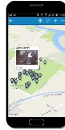
È disponibile una mappa interattiva in cui si possono visualizzare le altre tappe del percorso