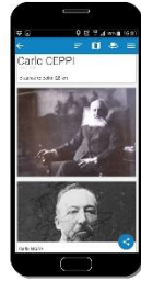
Cliccando sulla guida si visualizzano le tappe del percorso