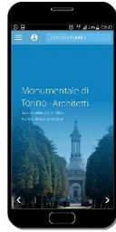
In questa schermata è possibile visualizzare tutte le guide del percorso disponibili