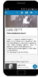
Selezionando le foto si accede alle informazioni aggiuntive