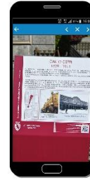
Attivando la fotocamera sul QR code si accede alle informazioni audio aggiuntive