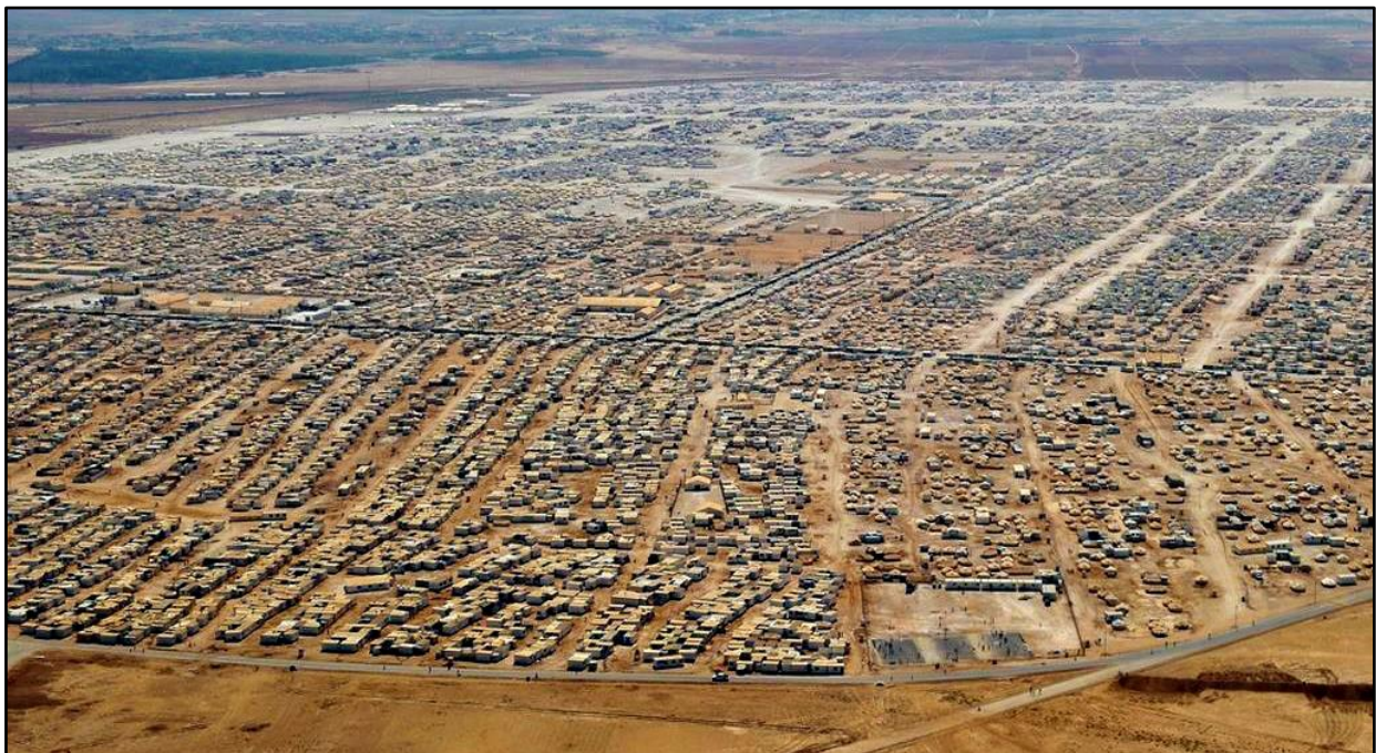
Za'atari Syrian refugee camp, Mafraq Governorate, Jordan.

In the first chapter of the thesis, I propose a critical review of the definitions of the settlement concept and how this concept has evolved over time. Then I will introduce a new concept of distinction or that between “permanent and temporary settlements” that is the key element of differentiation between a traditionally evolved town and a refugee camp that artificially evolved. Finally, as the temporary camps for some, over time, it is transformed into permanence.