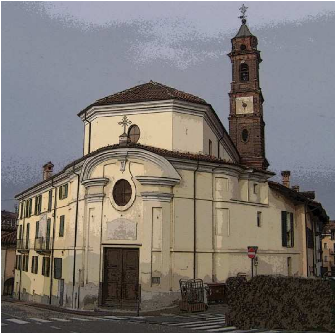
Sant'Antonio Abate church nowadays

This Master's degree is a continuation and extension of the project started in my Bachelor's degree, which was mainly focused on the historical background which brought the architect Bernardo Vittone to Fossano, his artistic choices and his relationship with the client.