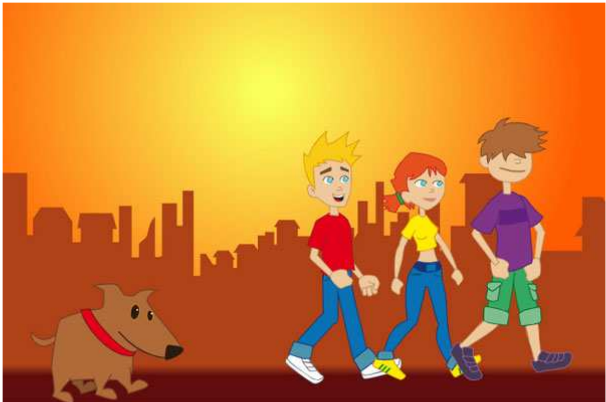
The main characters in the motion-comic