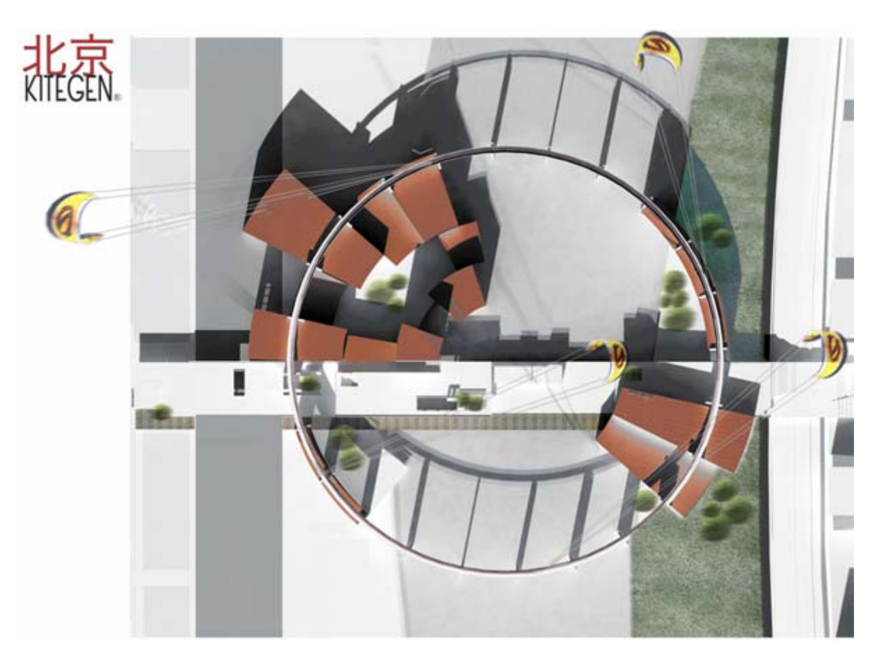
Beijing KiteGen Materplan