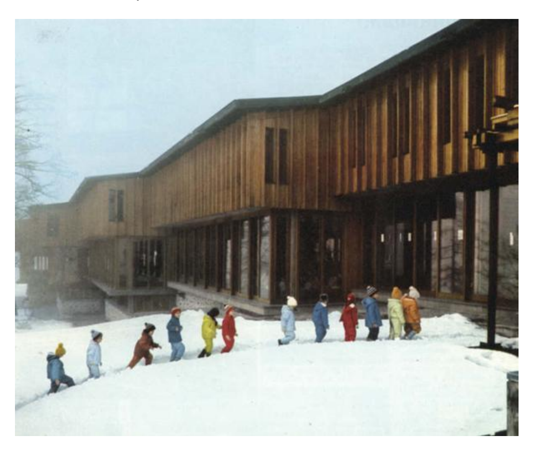
Olivetti Mountain Colony, Brusson – Arch. Conte and Arch. Fiori

The birth of the above-mentioned can be noticed between the nineteenth and twentieth century, there is the acknowledgement of a specific culture in the Valle d'Aosta region and the desire and policies to preserve it; in a crucial moment like the passage from the Kingdom of Sardinia to the Unification of Italy, a sentiment of Identity of the Valle d'Aosta region is formed, an acknowledgement of diversity, a research for the "Valdosta ethnicity" – the idea of a "patrie valdôtaine" – characterising the historical elements that were marked by battles in order to defend the Valdosta peculiarities , specifically the mountains and the linguistic differences in respect to the rest of Italy.