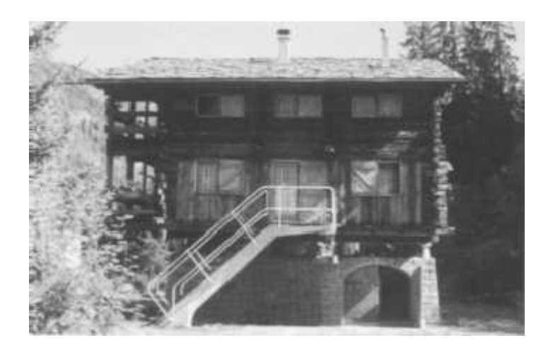
Garelli premises, Champoluc - Arch. Mollino

The rural and spontaneous architecture was studied and analysed by modern day architects through works of the conventions of the Institution of Mountain Architecture, which met for the first time in Bardonecchia in 1952.