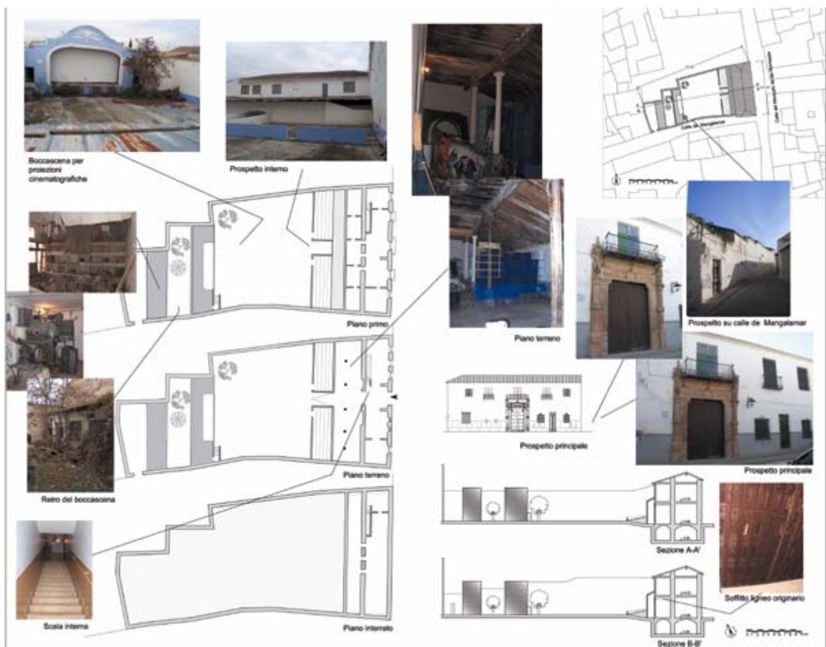
Oviedo Palace relief and actual state

The title of this dissertation introduces a context which places it in the region of Castilla-La-Mancha in the heart of Spain: Almagro , known because of an interesting theatrical festival that takes place there every year in the month of July. The analysis of this location was done in such a way that allowed us to gradually focus in on the essence of the place seen as a whole: the project to insert a theatrical space into a historical and monumental building; Oviedo Palace , at the moment in a state of disuse and decline despite its undoubted architectural valency. It was built in the 16 th century and was the noble home to one of the oldest and most powerful almagro families, the Oviedos.