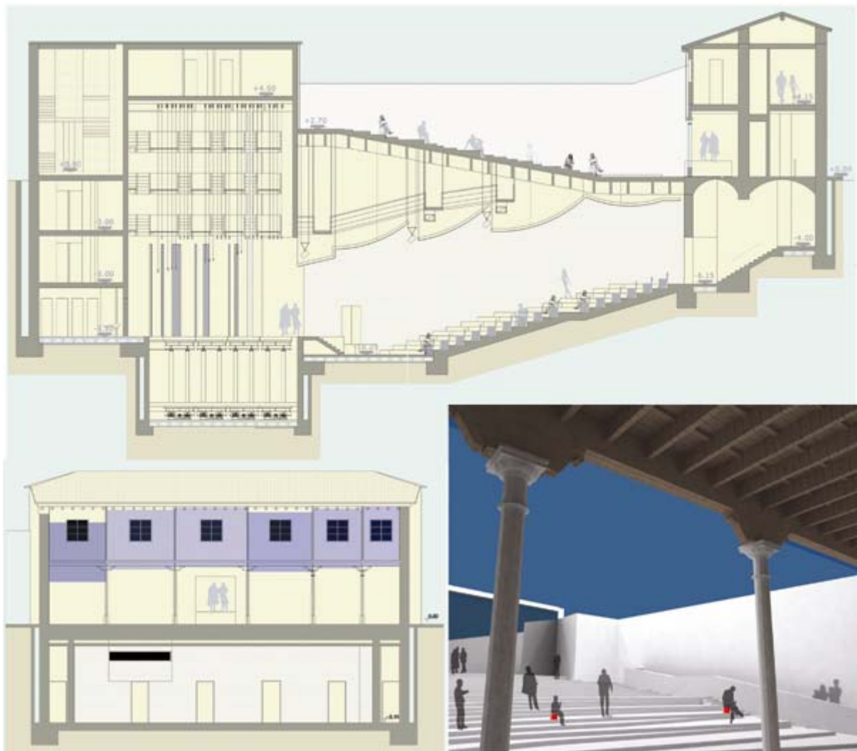
Longitudinal section - Prospect interior - View of interior patio as pit

The first step was to understand the stages of the urban plotting; a morphology as homogenous as this would not be able to cope with the oversized volume that would be needed to create space for a new theatre, with specific reference to the imposing size of the scenic tower. Particularly, regarding the plot in question, its small dimension needs to be considered. The solution was to create a hypogeum theatre with the stalls completely underground which could be accessed from the vaulted cellars of Oviedo Palace.