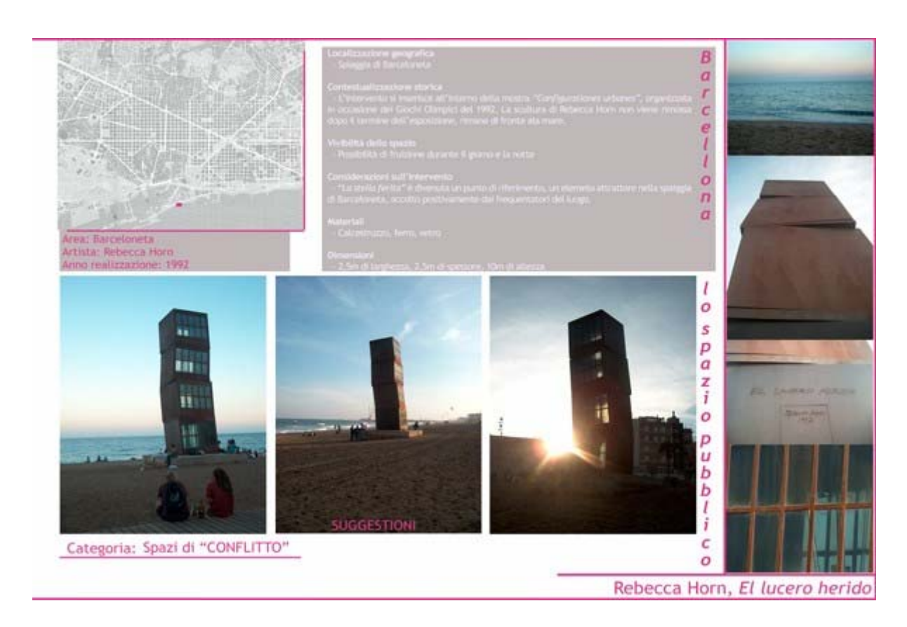
Conflict space: R. Horn, El lucero herido, Barceloneta beach, 1992

"Conflict" spaces are places where the power and the emotion created by the work of art express critically architecture and its context (Examples: Plaça Palmera, Plaça Morague, and playa de Barceloneta).