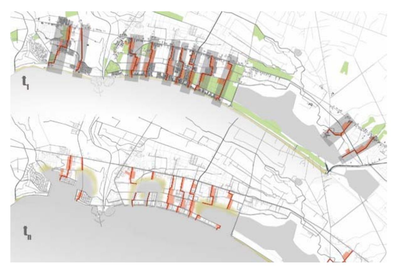
Fig.1: Transformation phases: t_1 - the transformation is oriented according to directrices which are transversal to the coastline; t_n - complete erosion of the coastline and flooding of the agricultural area with the consequent birth of new beaches among agricultural fields and urban blocks

The aim of this study is to reduce the distance between coastline and agricultural fields. The coastal portion has been reconsidered through orthogonal directrices towards the sea: proper connecting devices between the beach and the agricultural fields, which allow an alternation in the density of different coastal strips. The least dense strips will enable an opening towards inland areas which will be suitable for bearing flooding while the densest strips present portion of sea front and residential illegal centres which can face he water invasion. The result is the opportunity to have new beaches in the midst of agricultural fields and new urban blocks which both represent, on the one hand, an extreme form of touristy and agricultural cohabitation (Fig. 1) and, on the other hand, the interaction between two opposite practises (Fig. 2).