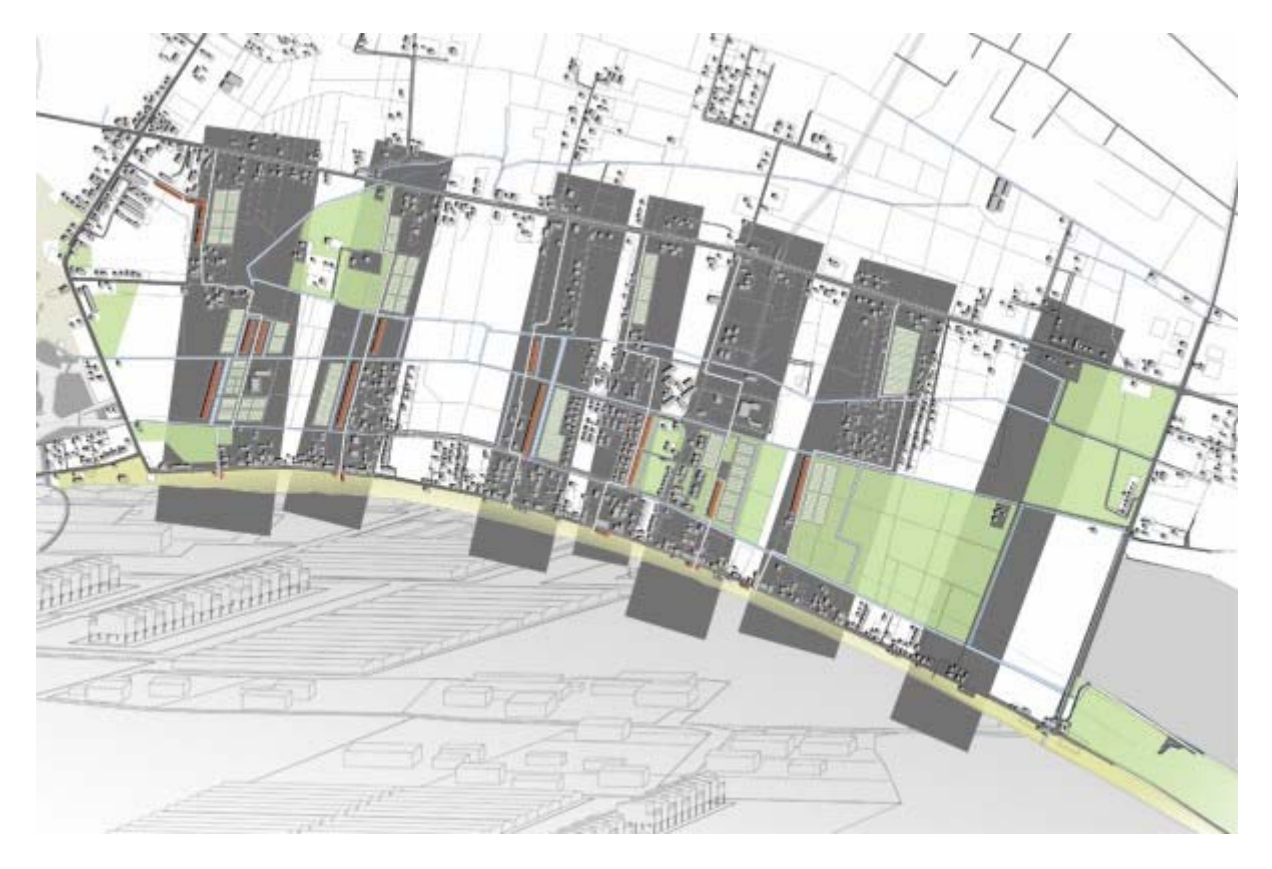
Fig.2: Building of the territory through transversal bars: elements which regulate and generate new spaces defining new forms of cohabitation between touristy and agricultural practises

The study focused also on those aspects which are linked to the type of agriculture suitable for that area, favouring the horticultural production and greenhouses – absent in Latina but present in the Pontine province. The development of the coastal companies has been assumed through the building of greenhouse fixtures and fittings, which fit the reorganization of the housebuilding.