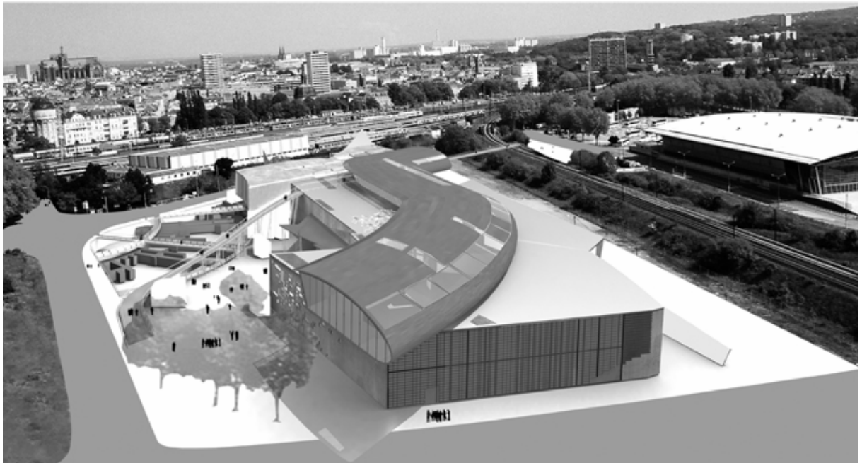
Photorealistic representation of the project inserted into the context

Centre Georges Pompidou and Metz, city of northern France, in January 2003, in accordance with the Ministry of Art, Culture and Transport, announced the plan to construct the first decentralized organism of the Art Centre Georges Pompidou of Paris. The building of 12000 sqm, that includes some 6000 sqm for exhibitions, is intended to house works of art of large dimensions not allowed in Paris because of the small size of expositive rooms.