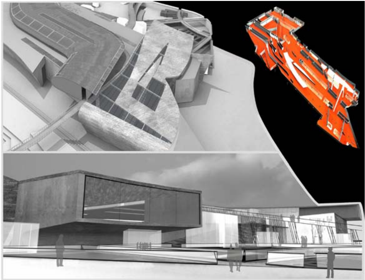
Rendering and axonometric cutaway of the museum on the ground floor

On the ground floor in addition to the Forum there are the Administration Department and the “Big Nave”, space at a great height about 15 metres in order to exhibit works of art of large dimensions.