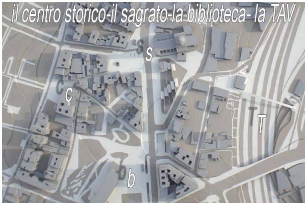
Masterplan scale 1:500 of the intervention area

This process of non stopping transformation has been the scene of many different interventions : from a urban planning to an architectural scale.