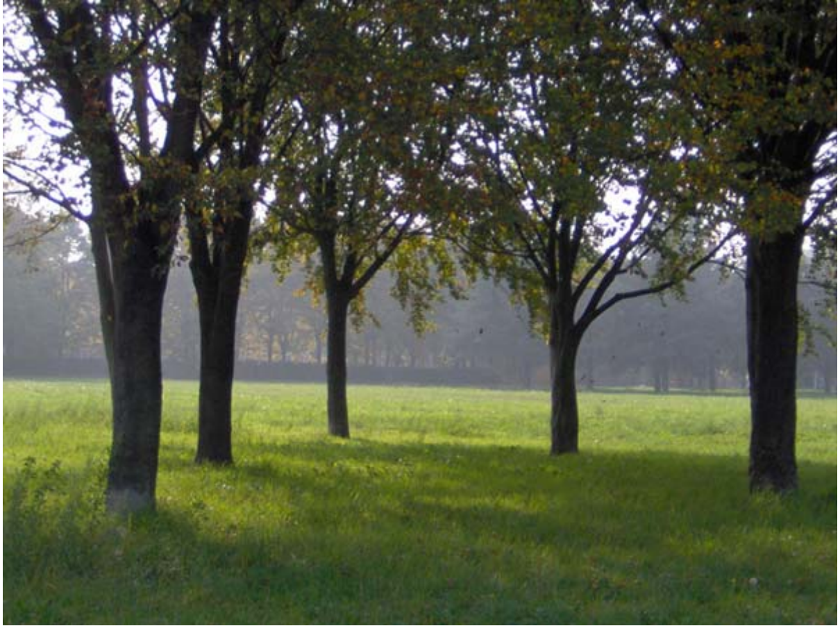
Caption: The 'Dalla Chiesa' park, Collegno

Great care and attention must be taken in the conservation and improvement of green areas. A project must respect the delicate balance between nature and architecture as it aims to create an environment which caters for users' needs while preserving and protecting vegetation. Depending on the choices made by project managers the result can be harmony or cacophony, consonance or dissonance, confusion or contrast.