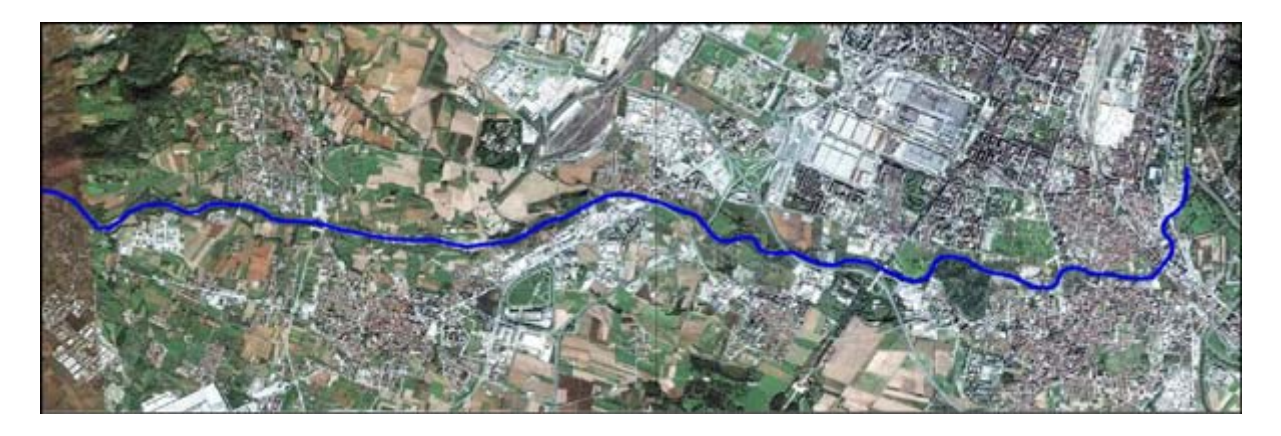
Aerial view of the study object area

Some towns are forming recovery and intervention campaigns and projects, but the importance of create an unitary project clearly appears, following a common guiding thread which is the river itself.