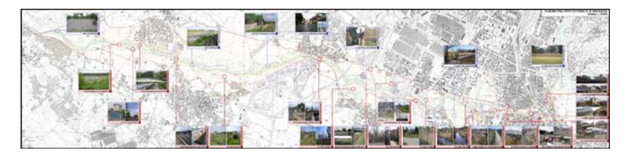
Planimetry 1:10000, with location of territorial contexts

5. in the last phase some schedules about point of force and weakness, in which suggest also to possible interventions object of future studies, in order to improve the landscape of this context of the torrent so extremely compromise.