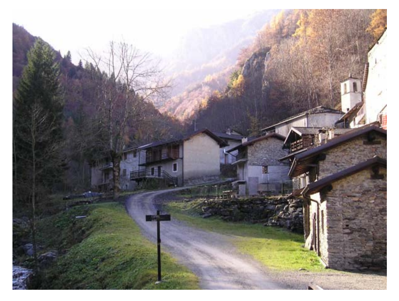
A foreshortened view of a Combe hamlet

In the same time, we sustain the conversion of some little mills for hydro-electric energy production, useful to the hamlet of Combe and for the other villages nearby. Three mills, which are located in the west of the hamlet, will maintain their productive function, which will be underlined with minimal ambiental collocation for improving the natural suggestive scenary that surrounds them. The mill set at the entrance of the hamlet will have an informating function and will work as a receptive area.