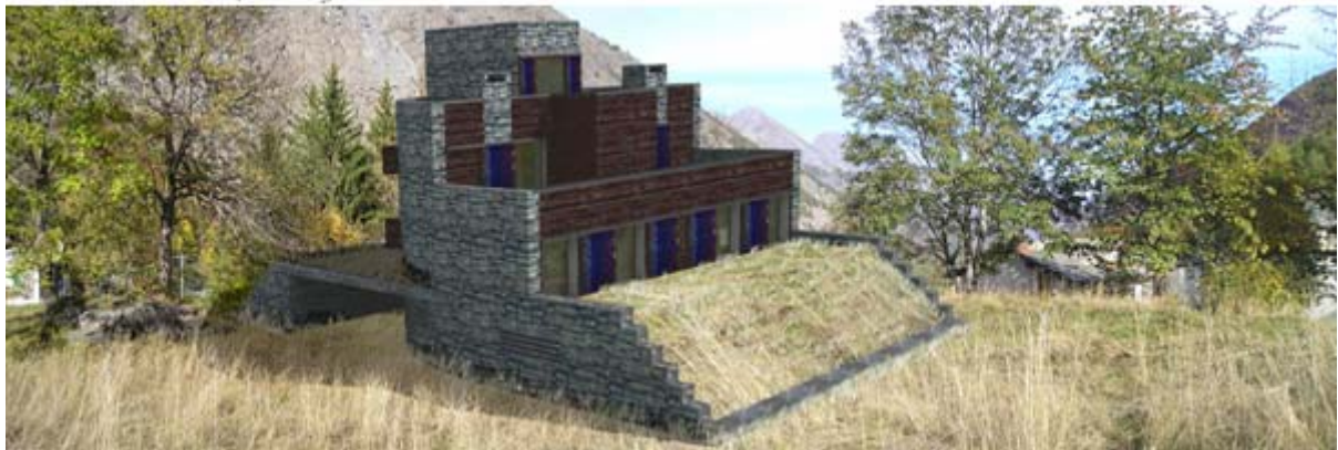
Final design: view from the south, section and Ecohouse in its environment – view from south-east