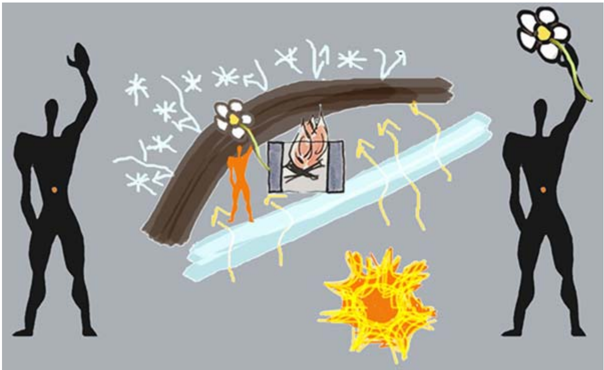
From "man sized" house till "eco-compatible man sized" house

The reflection bases itself on one of the most discussed architectural themes of the past century: the house , house "for everybody", "man sized" house. The first hypothesis is that today man sized house should be economically ecocompatible: ecocompatible to preserve the healthfulness of the environment in which the man lives and creates his life; economically (also from A microeconomics point of view ) ecocompatible so that it might result reasonable and interesting for everyone.