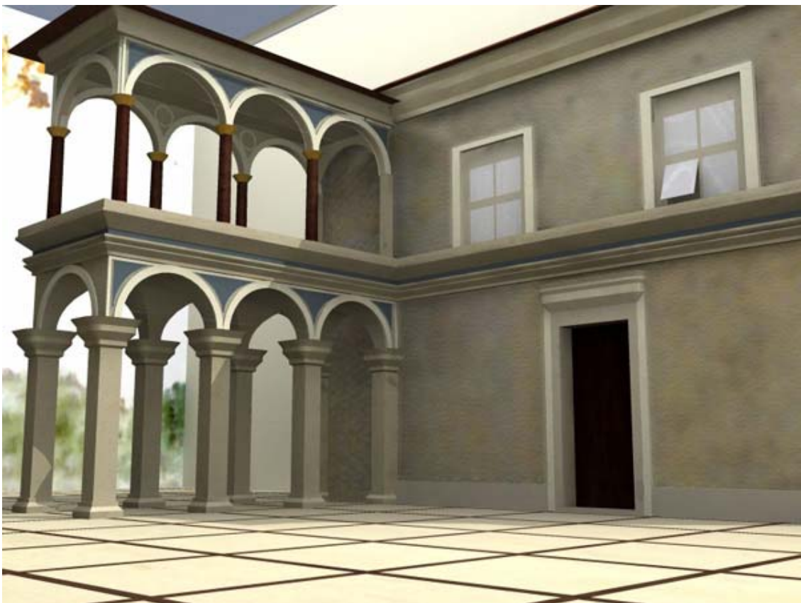
Two different “views” of the scene