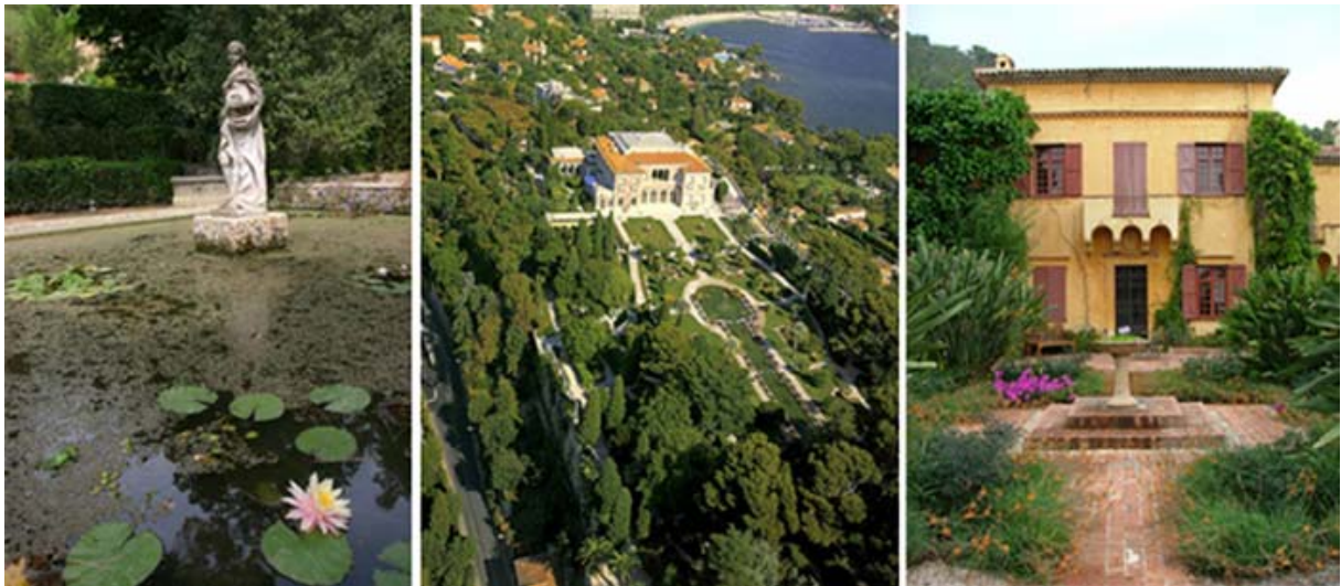
Garden examples: Serre de la Madone at Mentone, Villa Ephrussi at St. Jean Cap Ferrat, Val Rahmeh at Mentone

The second step of the analysis has been, through a structural reading of the gardens, the creation of a classification of gardens across the use of some important parameters such as form, style and territory position.