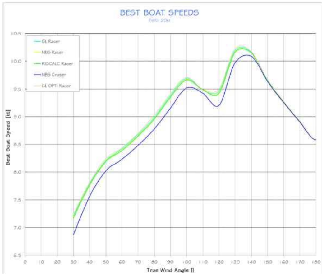
Best Boat Speeds – the different speeds developed by the boat with the different rigs envisaged as a function of 20 knot true wind angles