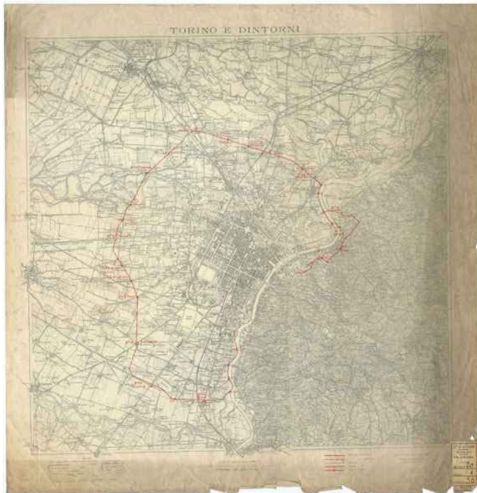
pic. 3: Torino e dintorni , Torino, Tip. e Lit. Checchini, 1914, in Città di Torino, Relazione circa l'allargamento della cinta daziaria di Torino , Torino, Tip. e Lit. Checchini, 1914, first enclosure (Archivio Storico della Città di Torino, Miscellanea, Lavori Pubblici, Poste, Telegrafi, Telefoni , no. 582)

Among the salient points of the town-planning scheme of 1906-1908 we must point out the official record of the villages connected to the 'barriers' of the first fence; the extension, where possible, of the main street axis of the town; a new road network considering the existing rural road network but essentially based on new ring roads, with a planimetric course tuned to the course of the first excise duty fence of 1853 (wide ring roads following the curvilinear course of the fence and connecting the existing rural villages); wide blocks incorporating the existing villages and urban conglomerations (to cut the expropriations which caused demolitions and to house industrial settlements). With the above-mentioned special law, the town got the extension of the excise duty fence, necessary by then to bear the heavy expenses for the infrastructure public works. The territorial limits fixed by the plan corresponded to a hinterland line, that should have become the new excise duty fence and should have been realized since 1909. But every decision was postponed. Not only: it was an unpopular project, thwarted by socialists in the Town Council and by the categories of industrialists and tradespeople, that brought the mayor Secondo Frola and his administrative board to resignations. Nevertheless, the town still presents deep signs of the line projected by the plan of 1906-1908.