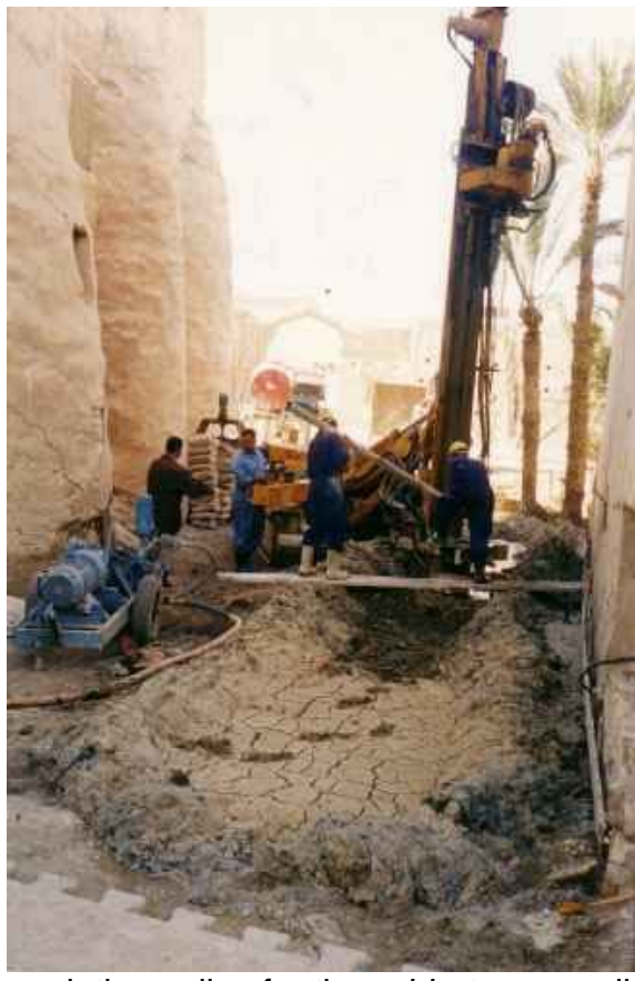
The foundations piles for the rubbatya consolidation

The analysis dealt especially with the research of structural problem's causes and studies the foundation's ground typology also describing the problems of differential ground sinking; the following chapter presents the consolidation's interventions really executed on yard, through foundation piles and punctually cracks closings.