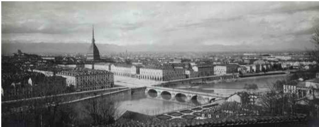
GIANCARLO DALL'ARMI, View of “The Murazzi” from the “Monte dei Cappuccini”, approximately 1920 (ASCT, Archivio Fotografico , Collezione Dall'Armi, R0310156)

“The Murazzi” along Po river were built between 1873 and 1890, realizing only in part a much more ambitious project which provided the complete arrangement of both river sides between actual Umberto I and Regina Margherita bridges, in order to carry out Borgo Nuovo and Vanchiglia quarter planning.