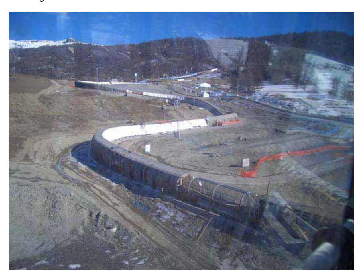
The new olympic track of the Bob

The Dissertation had as the main target to analyse the municipal district of Cesana Torinese and its changements during last years, in relation with the Olympic Games. Precisely the village will host some of the disciplines such as Bob, Skeleton and Biathlon. The analysis Involved the effects of the Games on the future of the area: in synthesis the positive aspects will involve the growing of the offer in terms of sport facilities that will act as a drag for a desirable increase of tourism and consequently of the overall economy of the area. Negative aspects will involve the submission of a mountain environment which has been profoundly transformed; the large number of cut down trees and the decrease of permeable surfaces together with the increase of the values of visual, acoustic and atmospheric pollution. Big transformations are involving also the touristic field.