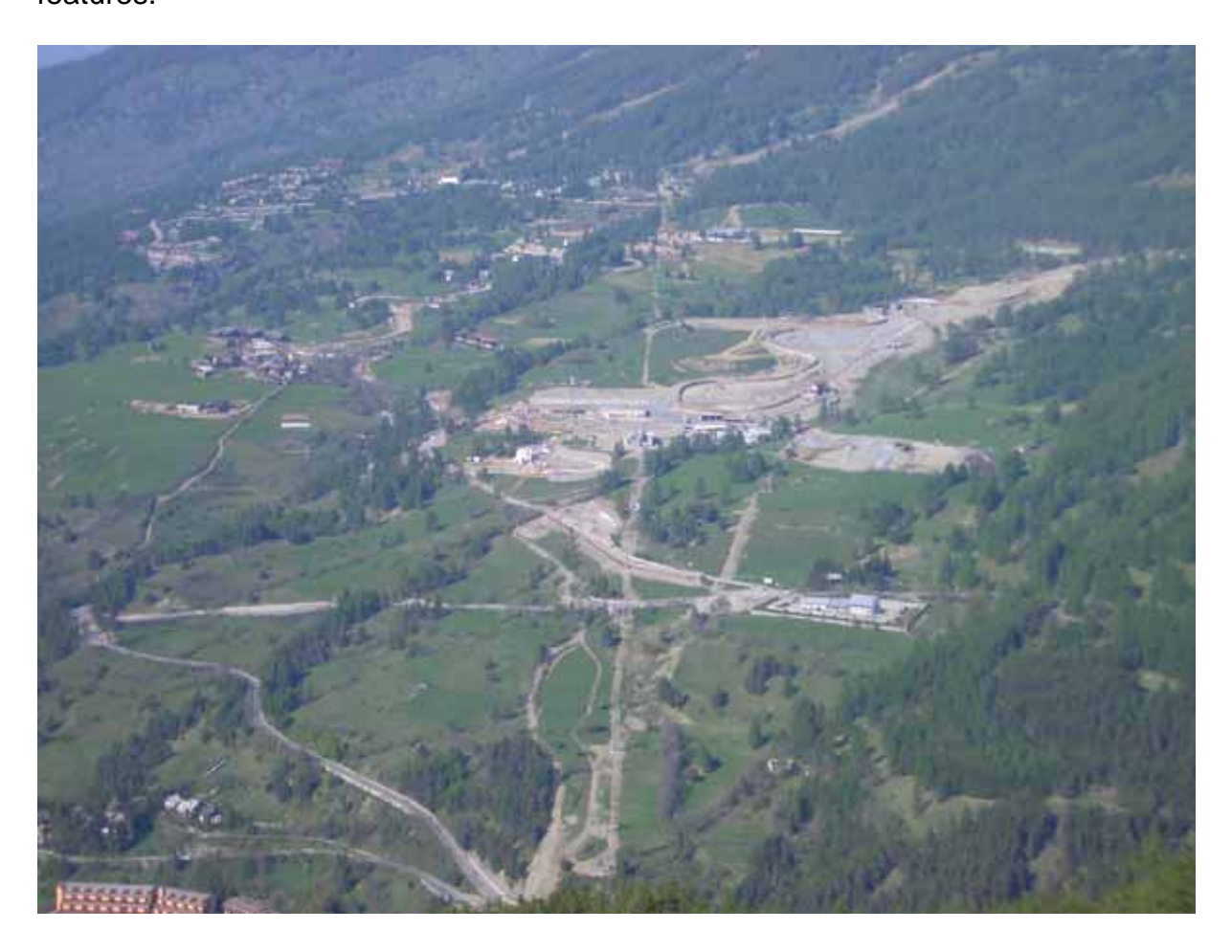
Panoramic olympic area

Being the PRG the organ who conveys all urbanistic decisions, in the Fourth chapter of the dissertation it is tried to place alongside to it, a document for environmental valutations. The target was to analyse the leading lines of the project Enplan for the Strategical Environment Valutation (Valutazione Ambientale Strategica VAS) and therefore to let coming out the existing differences between the good intentions presented in the abstract of the PRG and in the enclosed Environment Report (Relazione Ambientale), with the principles set by Enplan; those differences are principally dued to Cesana primary need of realising all structures for the Games, and just after that to protect and eventually enhance the mountain's environmental features.