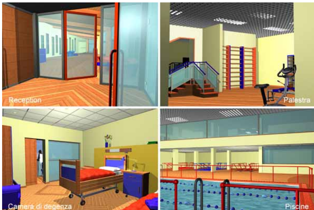
Render of some internal locals

From each of these two last described floors patients can easily reach (through special ramps or with the lifts) to the other adjacent building where the medical activities take place and which is situated under the pensile garden already mentioned.