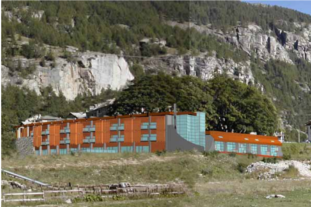
External view - Left: patients room – right: activities complex