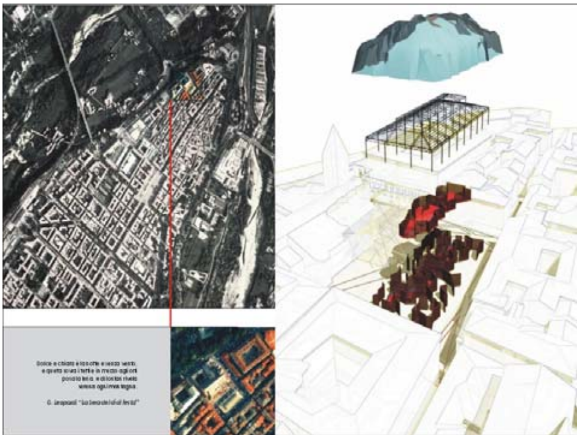
Area framing and axonometric explosion

In recent years a lot of work has been done to develop many of these projects; however, a careful analysis of the actual state has highlighted the necessity of strengthening one of the most significant services: the Civic Museum, located in the complex of San Francesco next to Piazza Virginio. For this reason, the suggested project foresees the enhancement of the whole area and the introduction of some further functions to support the museum activity such as a Picture-Gallery and an Urban Centre, using the old market structure of the square.