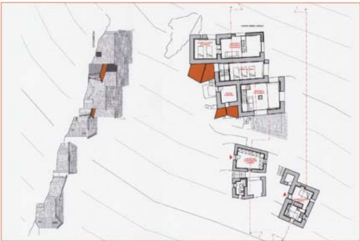
Intervention example on existing building

Second intervention consists in the adaptation of some stables-haylofts into a farm holidays structure in the Artondù deep valley; therefore the practice of the pastoral activity is improved with a specific tourist receptivity.