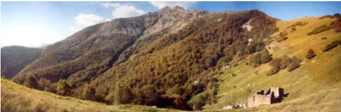
Artondù deep valley on the slopes of Besimauda Mountain

A built "world" can be discovered by rising from Pradeboni, passing through the Meschie area and climbing to Artondù deep valley. When a primary importance in the subsistence agro-pastoral running was given to the mountain, this area was anthropized. Deserted since a long time, it tends now to hide in prickly shrubs and to camouflage itself among trees. They are buildings for seasonal use that, together with other installations such as hamlet, village, isolated house, reflect the complexity of the local mountain settlement process, that was particularly dynamic during the demographic expansion phase which culminated in the last decades of the nineteenth century. The farm is structured on different levels of altitude in order to exploit the resources fully; this causes the decentralization of activities, which require the support of buildings for temporary use.