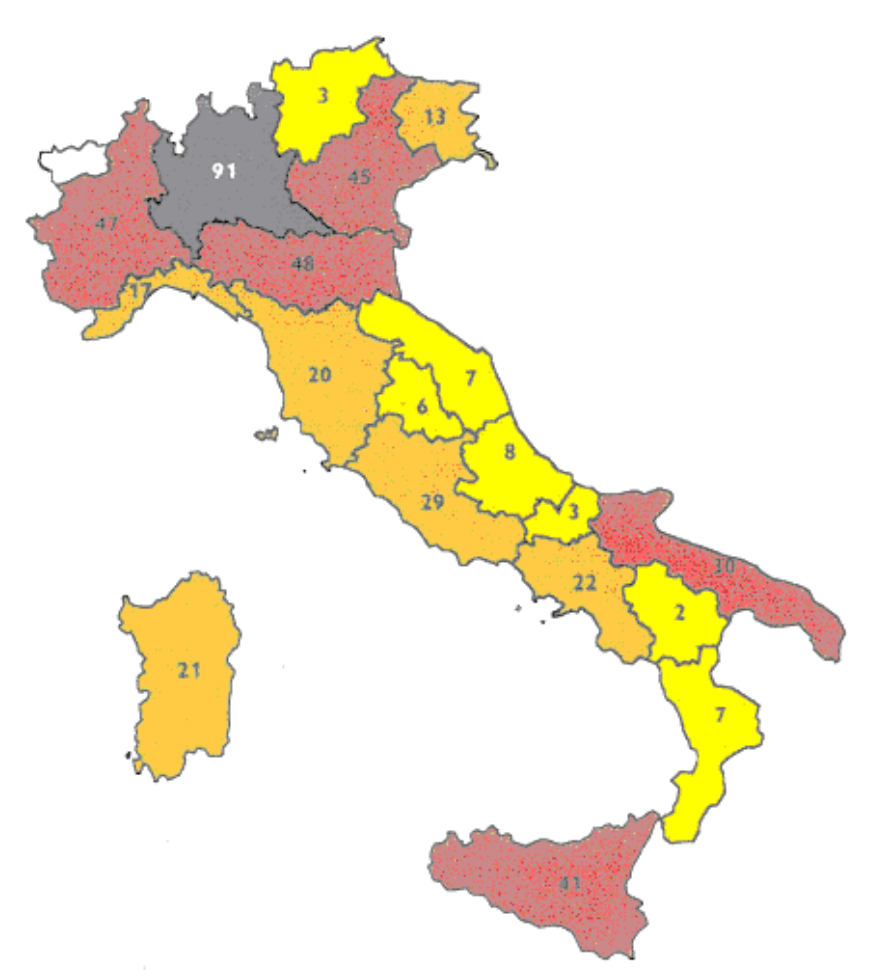
The numbers of industrial areas with the risk of relevant accidents in Italy (from "II rischio muto" – Costruire N 204, Maggio 2000)

In order to understand the extension of the risk imposed on the territory by the industrial plants, three cases were studied, that of the city of Trieste, of Piombino and of Ravenna.