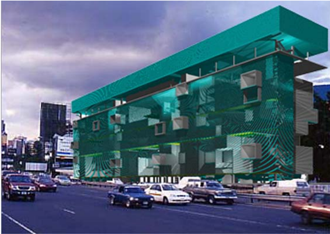
Montage of the residential structure seen by the adjacent highway, south east view

Enclosed in an individual architectural object placed in the city of Caracas, multiple functions aimed to satisfy the demand of the increasing expansion of Telework in developing countries, giving a possible solution to the symptom of metropolitan centralization.