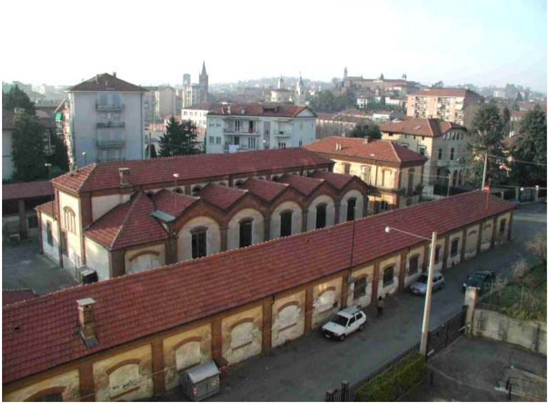
The old slaughter-house of Chieri

The old slaughter-house in Chieri is one such building; it is an example of an old public building that was once outside the town walls, but urban growth has become integrated into the town.