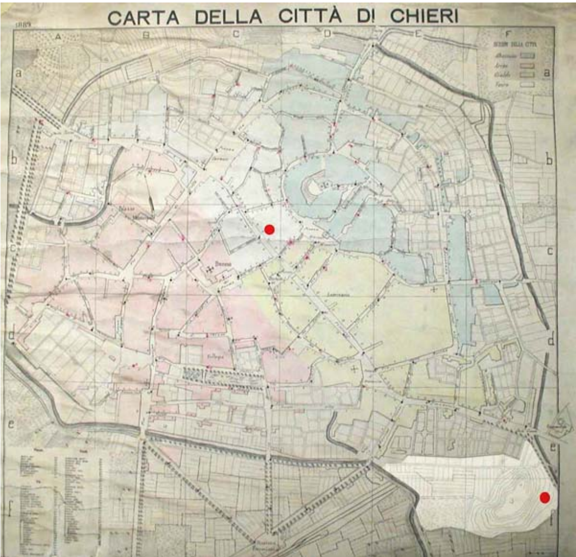
1889, Urban Planning of Chieri; it is highlighted the location, out of the old town walls, where the slaughter-house was built

It was then important to trace the urban development of Chieri and understand the reasons for the presence of this type of public building in this location.