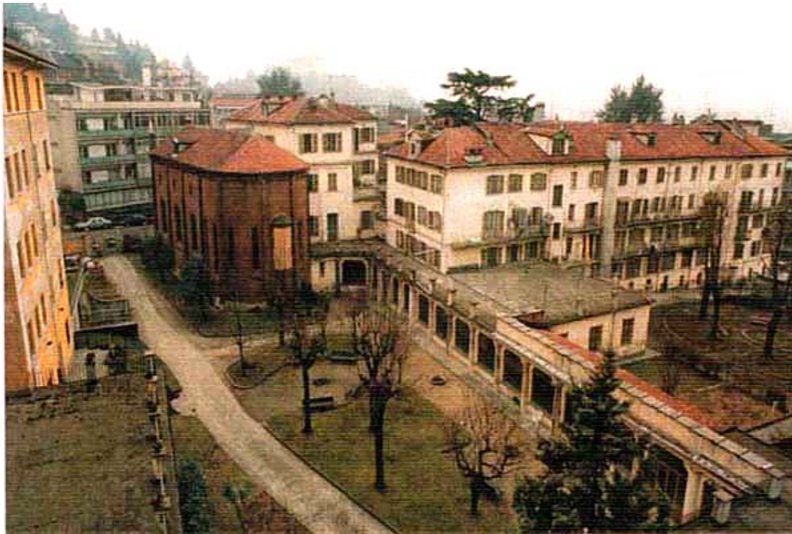
General view of the lot

The purpose of the thesis is to analyze the different constructive phases about the complex of the buildings forming the Opera Pia Lotteri , situated in Turin in the street Villa della Regina n° 21, in the foot-hills area of Borgo Po.