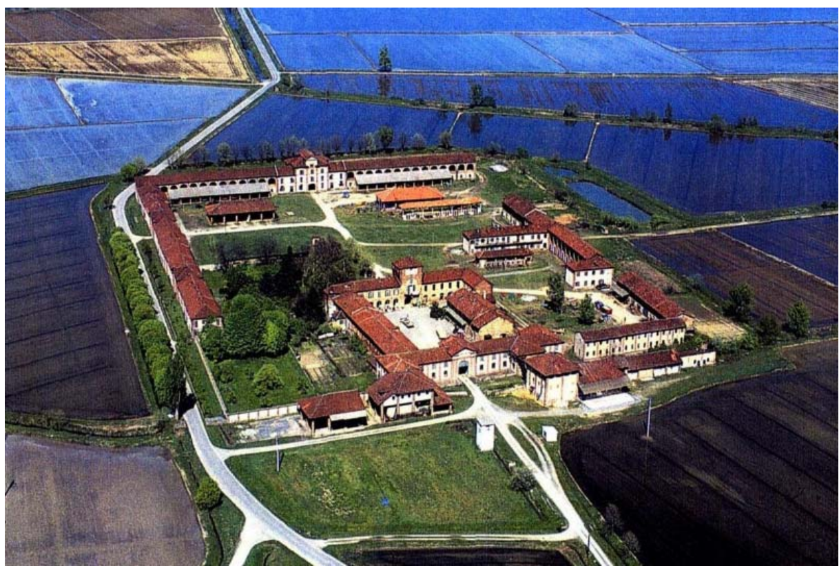
Overview of Estate Darola

Adjacent compounds, which take a wide area (about 40 sqkm) on the territory between Trino and Vercelli, are called: Lucedio, Leri, Montarolo, Castelmerlino, Montarucco, Ramezzana and Darola.