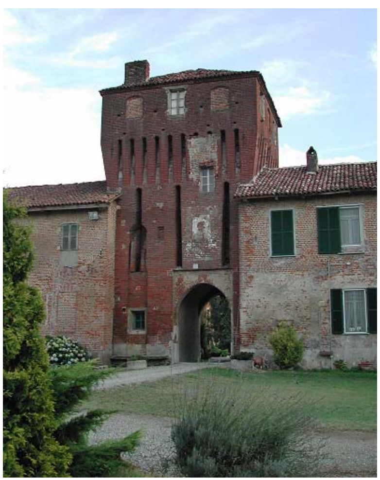
View of the tower, north site.

Darola Grange now Darola Estate still nowadays stands out for an enclosed courts building disposition. Inside you can still see the end 14<sup>th</sup>-century four-sided well-preserved tower from which you can have access to all the other courtyards.