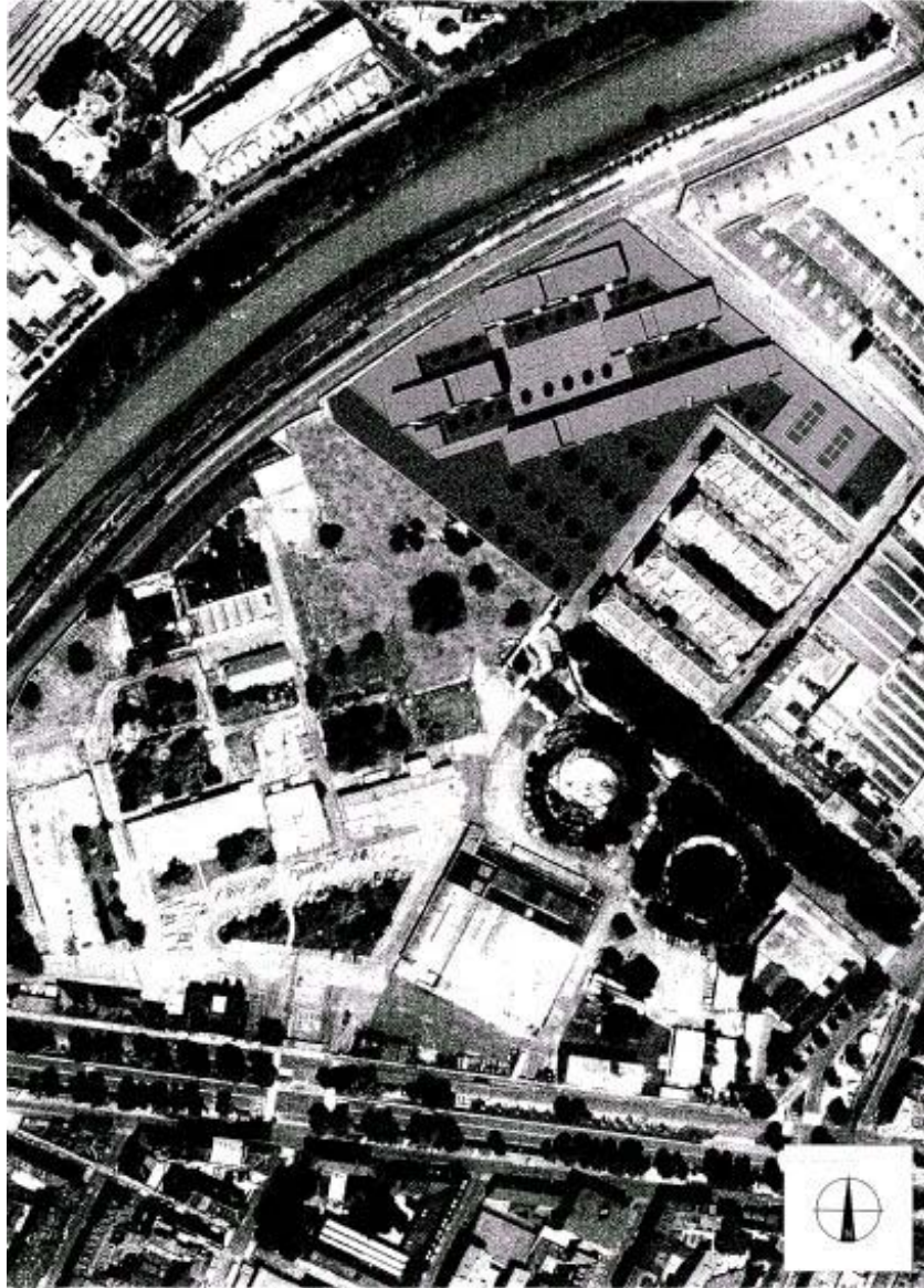
Aerial Photo Showing the Roof Covering Plan

We referred to the contingent claims analysis and to Cox's, Ross's and Rubinstein's exponential model, which are instruments that allowed the management flexibility to be considered by patterning uncertainty. For example, two different options were suggested: the alternative no-risk investment and the change in architectural allocation of the project. These options allowed the theory to be applied and a duly tested model to be built. This model could be included among the decision-making criteria supporting the traditional discounted cash-flow analysis.