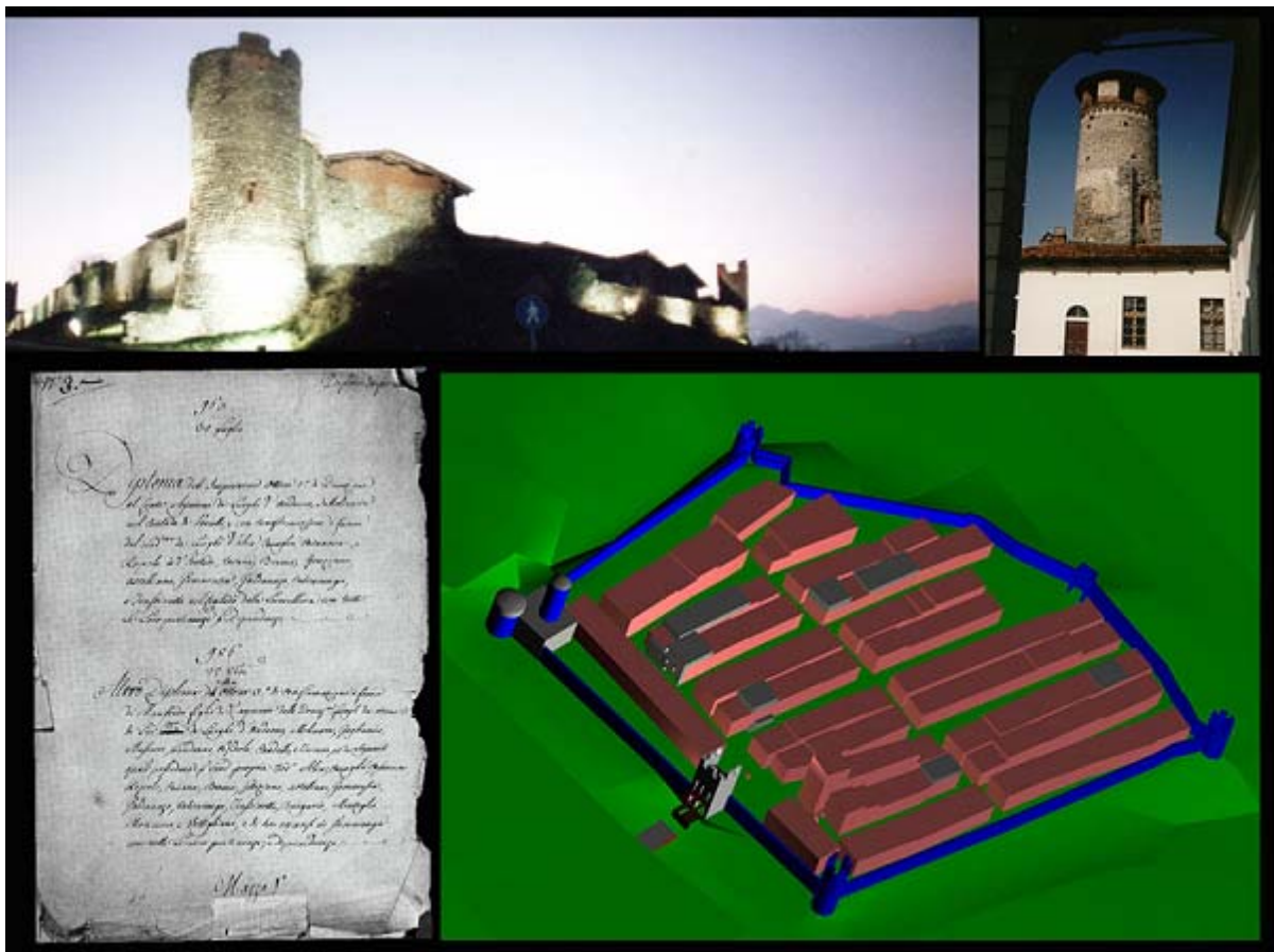
Candelo's Ricetto throw the story

At first it's aimed to an historical search, time to clear tie's consistency that from centuries joins local community's life to its ricetto, trying to make light on more recent history just untouched; at the same time the territory has been analyzed within it turns out inserted the ricetto and how it converses to the same one, characterizing it into a wide city context as one like a city in expansion like Biella's one.