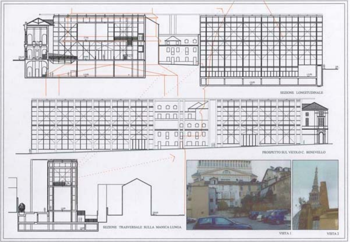
front view and section

We choosed to make a trasparent architecture because we want to show otside of the Centre its public role, and people who are inside the buildings.