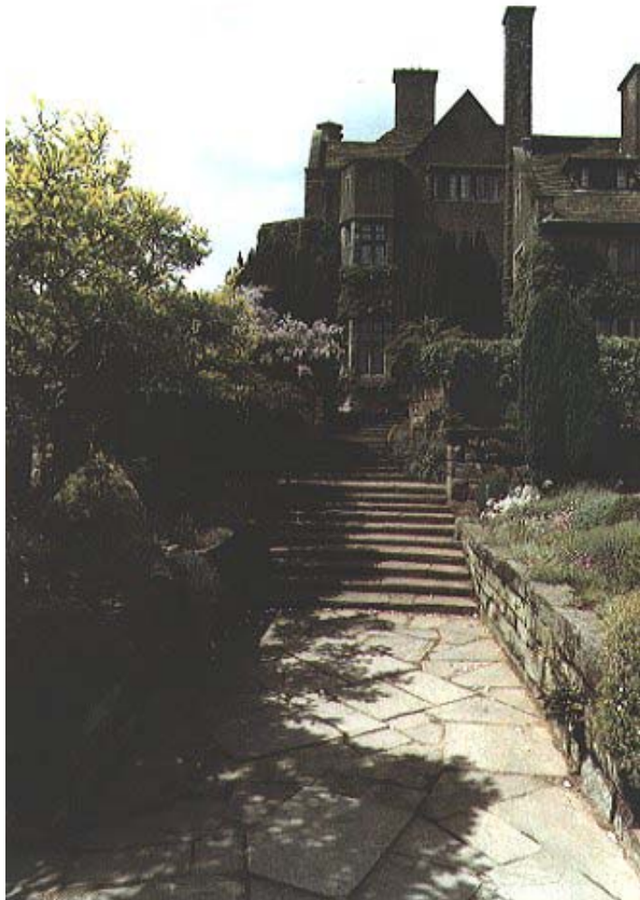
Tirley Garth: Mallows - West View

In the German area, the architects influenced by English publicistic, followed the formal stream, and they created green spaces like architecture transfiguration, the Palazzo Stoclet in Bruxelles represented the climax of this style.