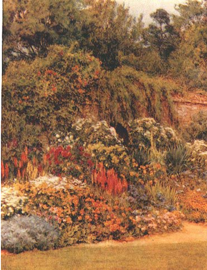
Munstead Wood: main border . Helen Allingham, 1900

Differently artists like C.E. Mallows, O. Hill, R.S. Lorimer and C.R. Mackintosh, the latter already careful to continental novelties, were more influenced by Blomfield and so more formal.