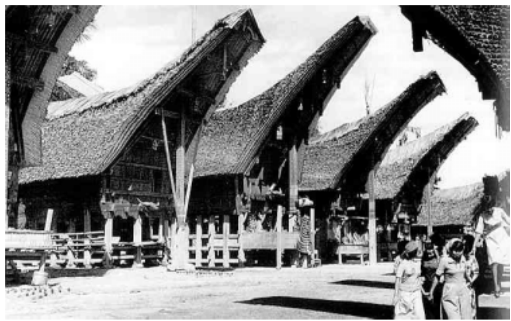
Palawa Village in the South of Sulawesi's Isle, Indonesia

We concentrated our attention, at the end, on the architectural contemporary thought and its bioclimatic aspects, which came out with Modern Mouvement's crisis and with the revaluation of local traditions at the beginning of the Seventies. In this case we tried to succeed in reaching two aims: