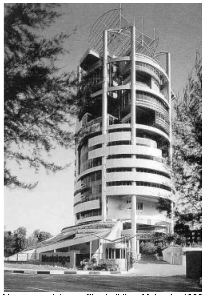
Menara mesinisga, office building, Malaysia, 1992

The recent urban development suffered by the South-East Asian cities in the last twenty years, has increased the demand of appropriate design models of skyscrapers: they should take the climatic requirements into account and they shouldn't be a simple imitation of the western ones.