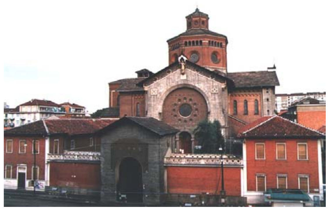
Sanctuary of Salute's Church in Turin

Particularly famous was the design of the Sanctuary of Salute's Church in Turin.