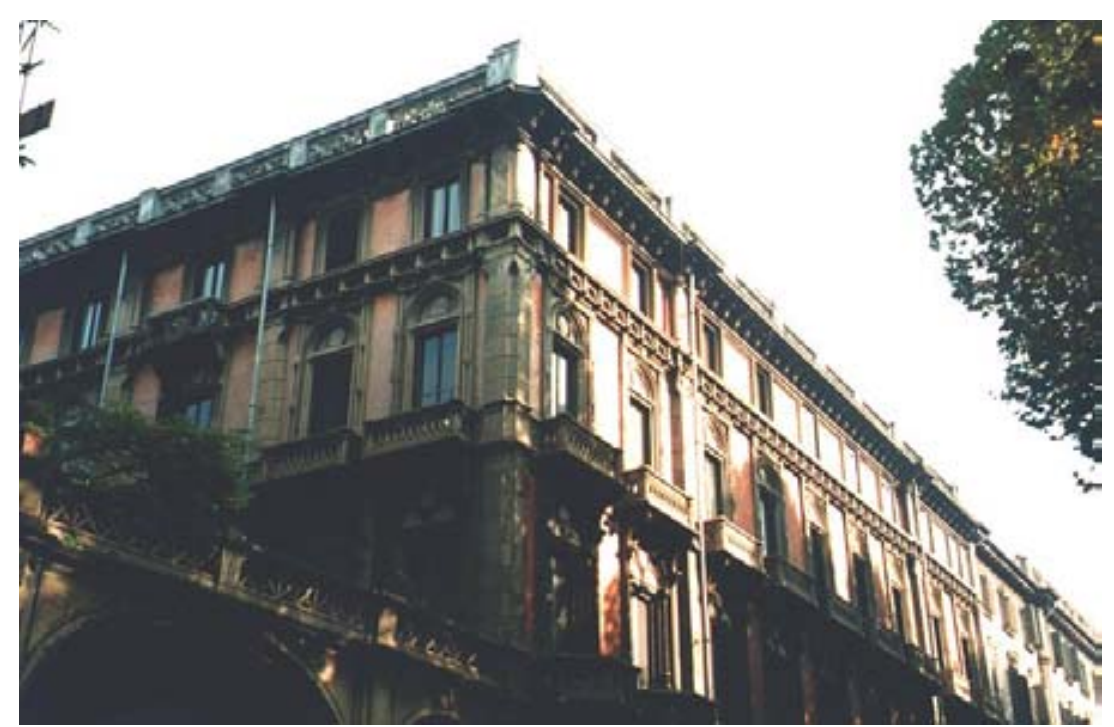
House Gani in Turin

Particularly famous was the design of the Sanctuary of Salute's Church in Turin.