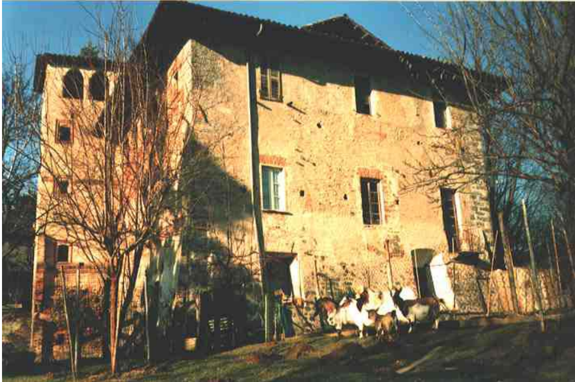
The rector's house. South prospect

The beautiful helicoidal stairs in the square eastern tower break the traditional compact system of interior space. Something similar is said to have existed in the areas of Verzuolo and Saluzzo, in South West Piedmont.