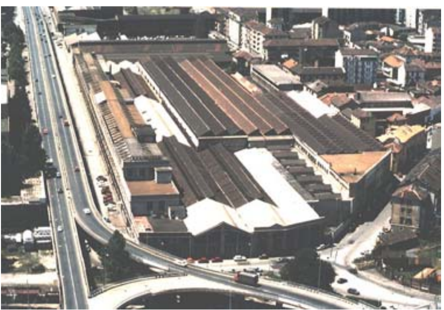
Aerial view of the area before transformation

Conversion problem of deserted industrial areas is one of the principal themes of the discussion that involves towns with an historical period of industrial expansion. There are different trends and ways of methodological approach for the study of that containers, real "pieces" of contemporary city, but two of them are the the most significant: one that recognize to the industrial architecture a dignity as witness of an historical period and another one that considers industrial areas as profitable places of landed stock for their position inside city.