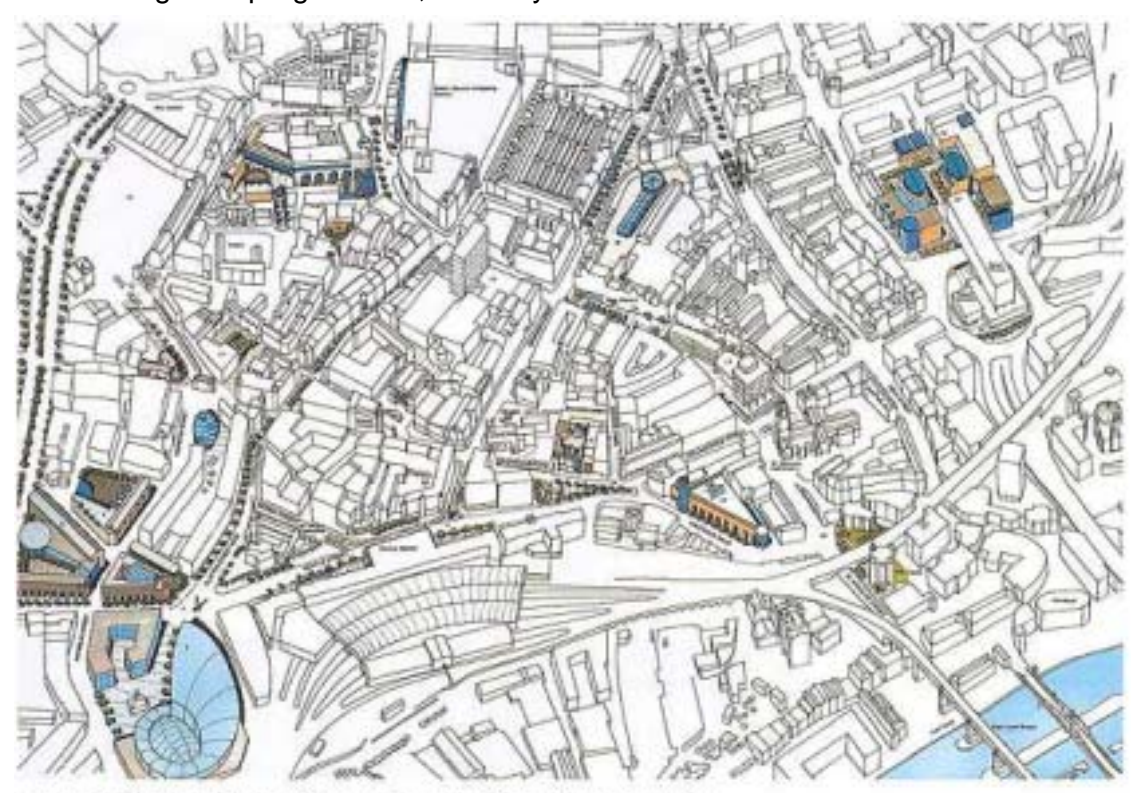
Area di Grainger Town, Newcastle upon Tyne. Assonometria.

The Conservative government in the 1980s led to a review of the inner-city policy, and concluded that a much greater emphasis needed to be placed on the potential contribution of the private sector, rather than on the Urban Programme. Changes in the regeneration policies resulted from two strands of Conservative ideology: the strengthening of central government and the economic liberalism. New implementation agencies were designated from the central government, which gave priority to the interest of private developers and property-led developments. During the 1990s strategic approach is proposed again from the central government, in the form of integrated programmes, centrally controlled initiatives.