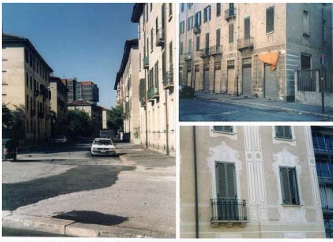
Quartiere di Via Arquata, Torino. Degrado edilizio e qualita' architettonica delle facciate.

The aim of the Dissertation is to carry out a comparative analysis between Italy and the U.K. with reference to urban regeneration policies and their implementation.