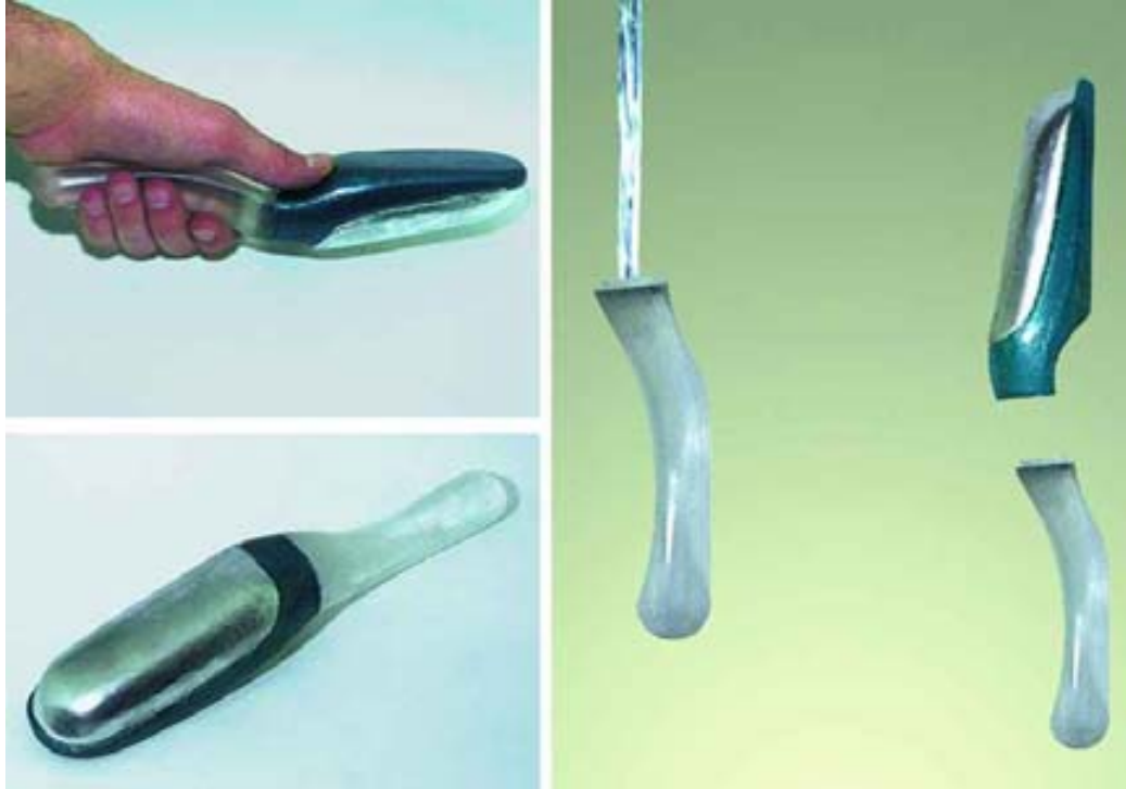
The iron: the handle, laid on its back, water-tank filling

The plastic handle is transparent and can be pulled out to be filled with water before being screwed to its main body again. Because of the small dimensions of the water-tank, water must be added every fifteen minutes. The water-tank is illuminated from inside by a luminous led which indicates the battery feeding level and also allows to check visually the quantity of water present inside.