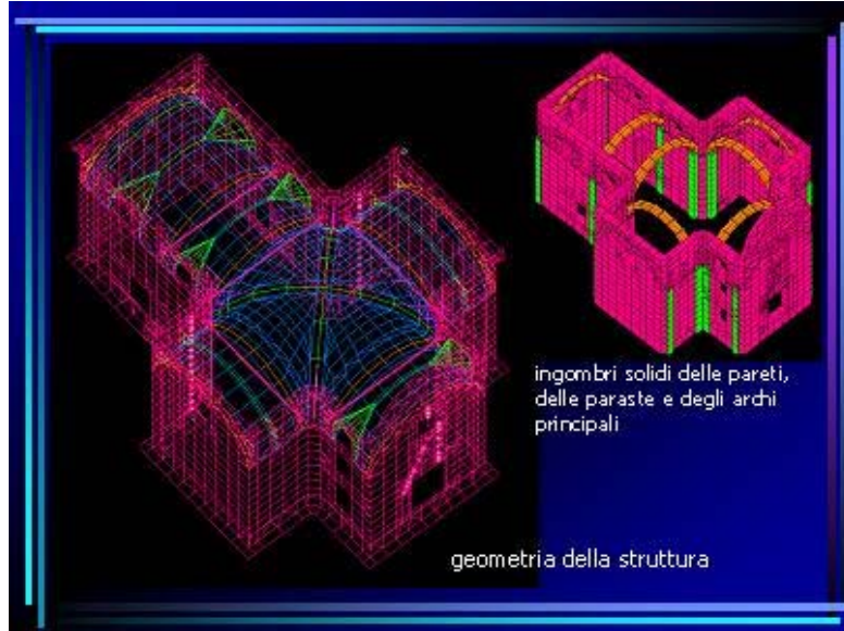
picture 2: geometry of the church and view of solid dimension of brick walls and arches

Afterwards a damage church was analysed by using a computer program based on F.E.M. in order to obtain the static behaviour and the dynamic reply of the church in case of future seismic events