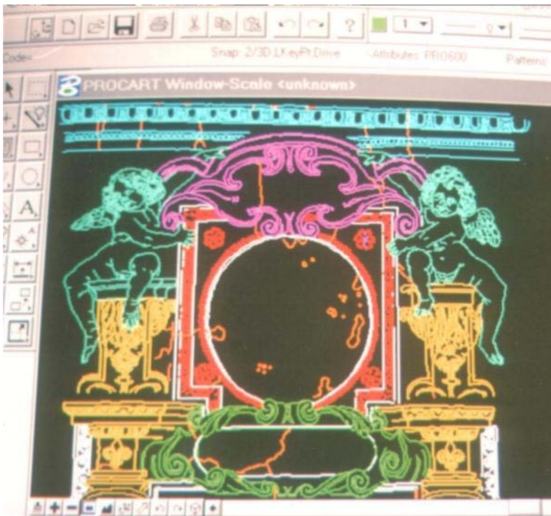
Figure 1 - Analytical stereo restitution observed on the workstation Leica SD2000

The study is set within the knowledge for the maintenance of the apparatuses to plaster in the rooms of the Valentino Castle to Turin, historical patrimony from which part and it develops to him "history" of the decoration to plaster of the Savoy residences, that has been submitted to loss of functional meaning in the time, to factors of degrade and restorations, together to the architecture that contains it.