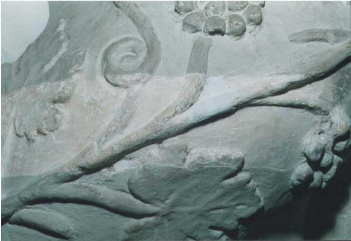
Figure 3 - Room of the Magnificenze, west portal. Stratigraphical section on the column

a documentation of reference graphics and photographic complete of explanations and of labels of filing.