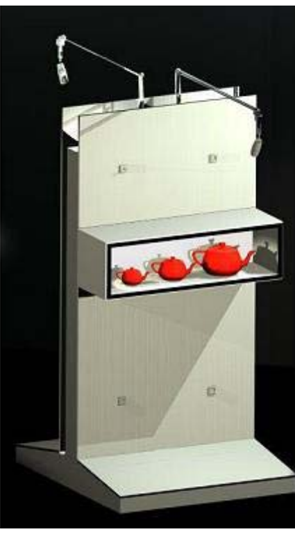
photo 1 - abacoWall finishing: laminated cocoa cherry-wood; abacoDuo finishing: varnishing white silk

The definitive project proposes Abaco, the exhibition system. As the name suggests, it is composed by an abacus of sectional components. Abaco includes four structures which are essential for a temporary exhibition. abacoWall and abacoDuo are respectively the wallpanel and the isolated panel. Using a special fixing system is possible to increase the traditional ostensive way: not only can you hang or suspend objects but you can also lean or protect them.