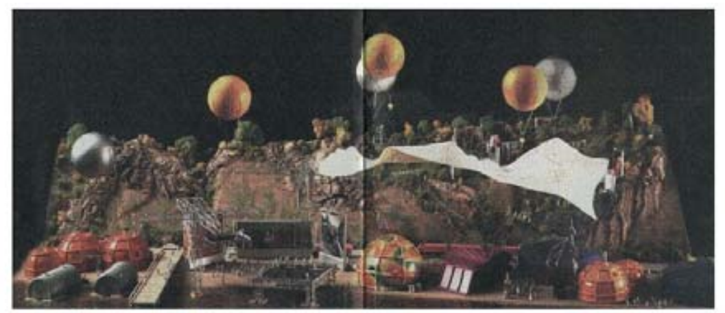
Instant City (Peter Cook, Dennis Crompton, Ron Herron, 1968)

A borderline theme of the Archigram Group was the vanishing of the city and architecture itself to allow the individual freedom and the satisfaction of the man's nomad instinct: this concept comes clearly from the "Living Pod", "Cushicle" e "Suitaloon" designs, as flexible, self-governing and support system independent housing units. The concepts expressed in "Moment Village" and "Instant City" assert the Archigram' research is drawing to dissolve the city, e.g. toward the anarchical city, continuously evolving and able to self-organize.