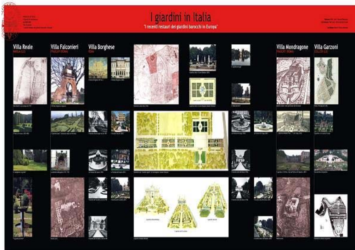
Italian gardens (graphic panel)

I also analyzed the gardens of the Isola Bella (VB), that, although have no restoration, are an interesting example of “good maintenance”.