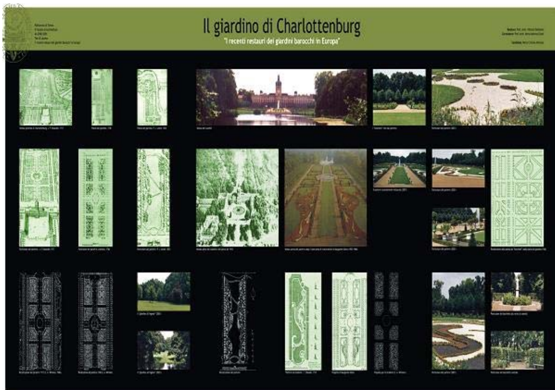
Charlottenburg's gardens (graphic panel)

The theoretical part was supported by some examples. The restorations examined are known at international level: Versailles and Vaux le Vicomte gardens in France, Hampton Court and Ham House gardens in England, Het Loo gardens in Holland and Charlottenburg garden in Germany.