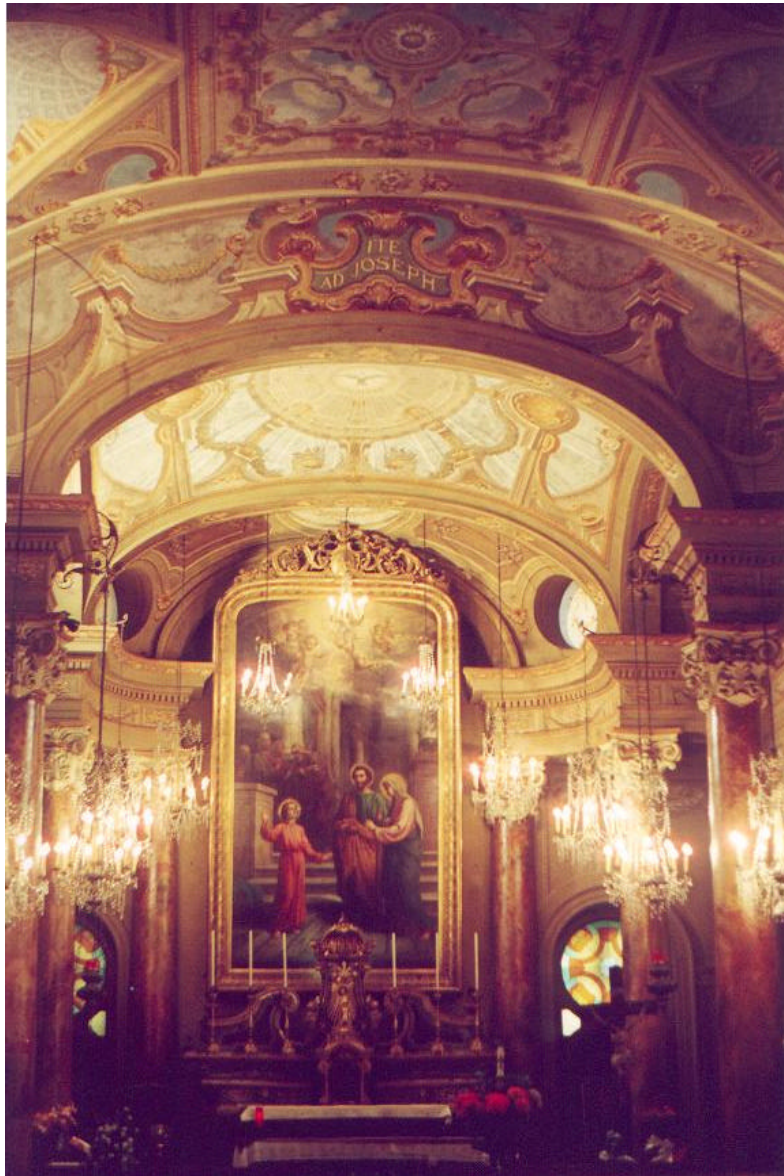
The Chapel inside Saint Joseph's College, designed by Brother Cecilio Costamagna (1872)

Relevant manuscripts documenting correspondence between priests builders and the Curia, the building expenses involved and the divergence between the building contractors and the buyers in question have been recuperated thanks to the Archives of the Metropolitan Curia. Included a number of documents relevant to new churches built in Turin parishes (signed by the Archbishop of Turin).