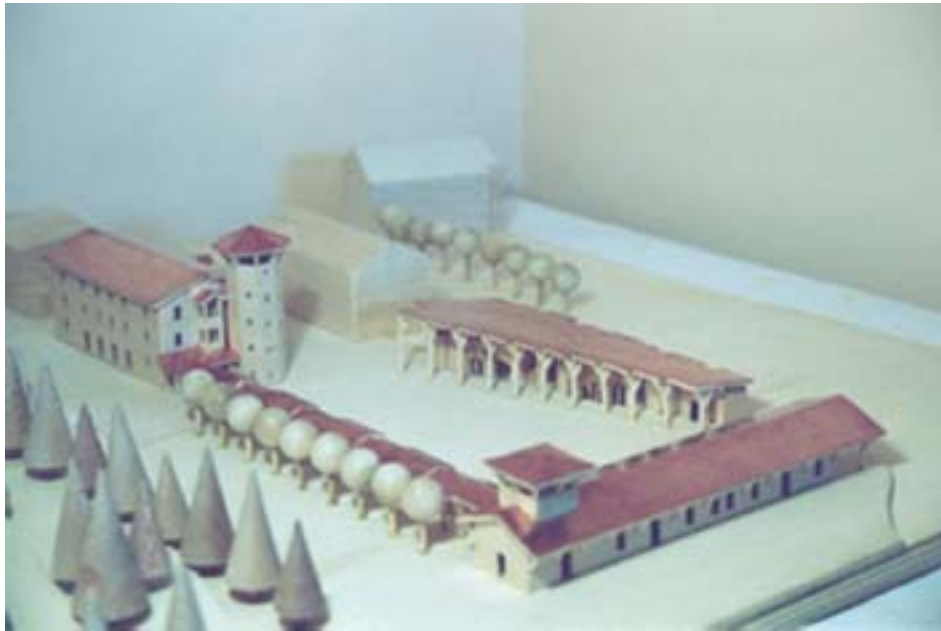
Plastic model of plan

built during the Second World War and still present in the mountains that surround the built-up area of Chianale.