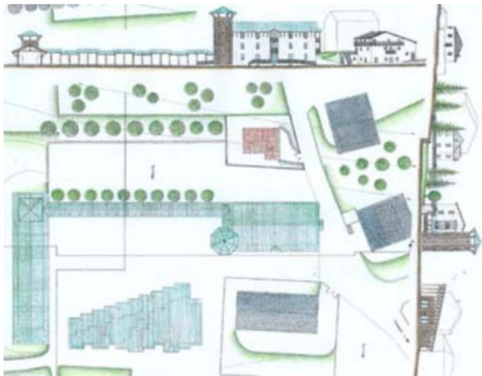
Planimetry and sections of the project intervention

The supposed functions for the creation of this new pole are: an information centre, the eco-museum of uses and local traditions, the conference and projection room, a first aid station, some trade services, a horsemanship, a sheltered fitted out area, the guestrooms, two look out turrets and two parking areas for cars and coaches.